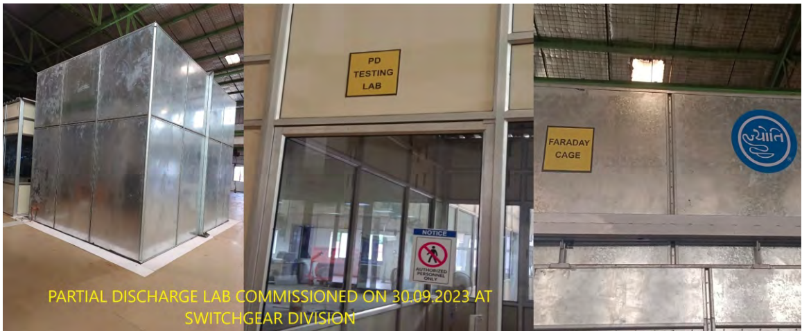
PARTIAL DISCHARGE LAB COMMISSIONED ON 30.09.2023 AT SWITCHGEAR DIVISION