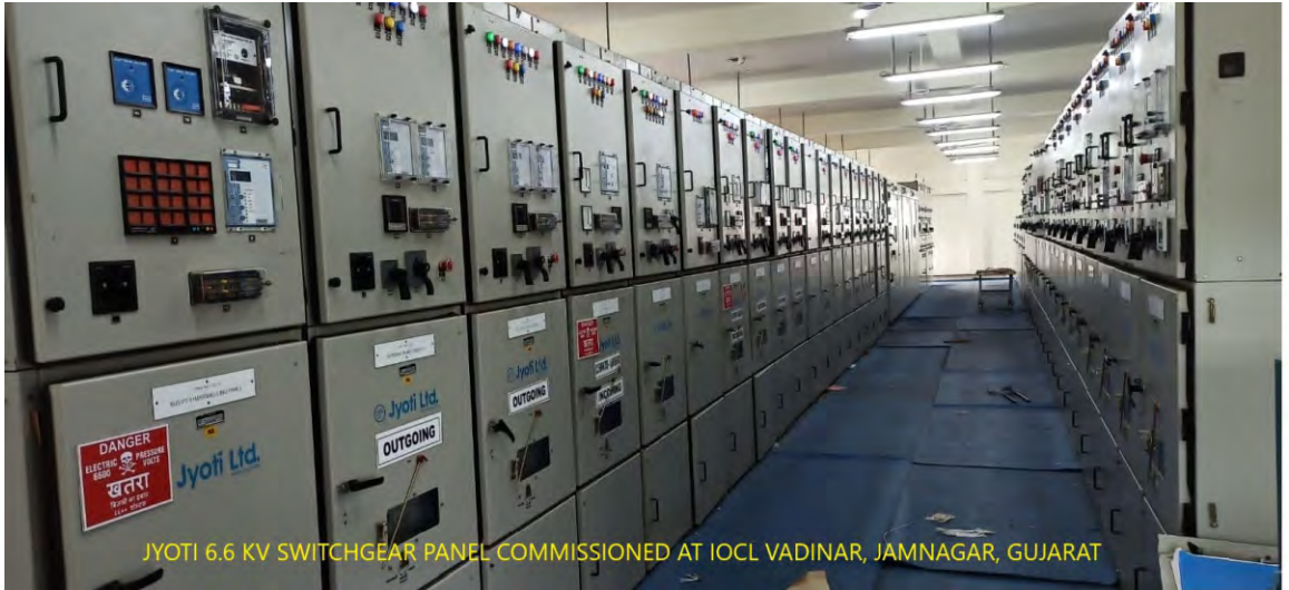
JYOTI 6.6 KV SWITCHGEAR PANEL COMMISSIONED AT IOCL VADINAR, JAMNAGAR, GUJARAT